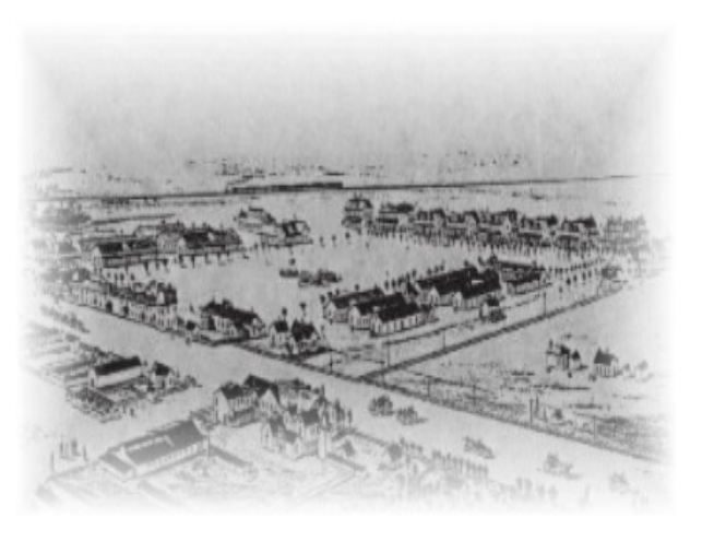
Fort Reno, Oklahoma Territory, 1891